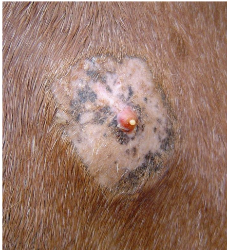
Note the severe swelling