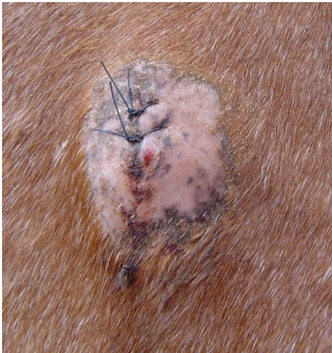
Presenting mass after draining 2 months old

Outcome: After just one treatment the pony was less sensitive and one could already touch the area. After 5 days the swelling had gone down completely. The pony made a full recovery.